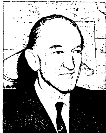
MAJOR KEYHOE JOINS MUFON BOARD